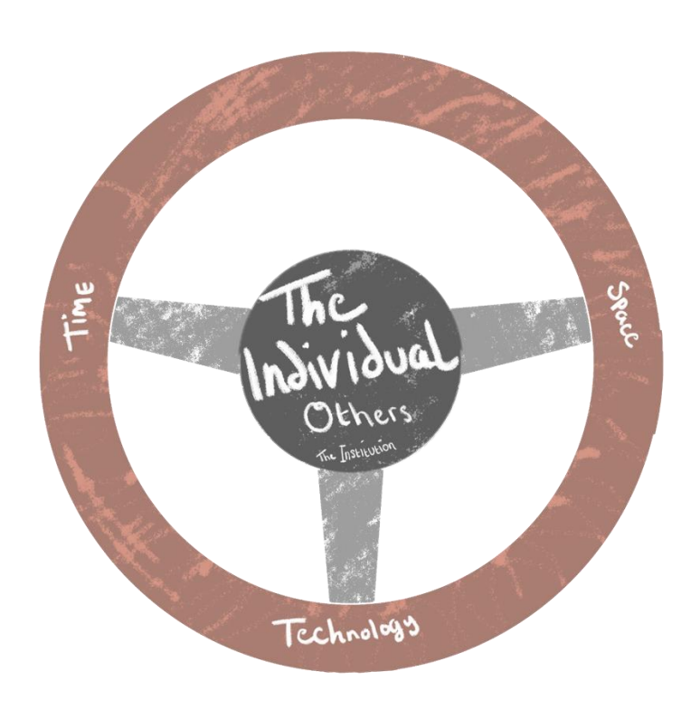
Figure 2. The steering wheel of pedagogic innovation and key drivers

The findings of this study have been brought together in Figure 2. This indicates who seems to be at the steering wheel of pedagogic innovation, its key drivers and how they are interlinked.