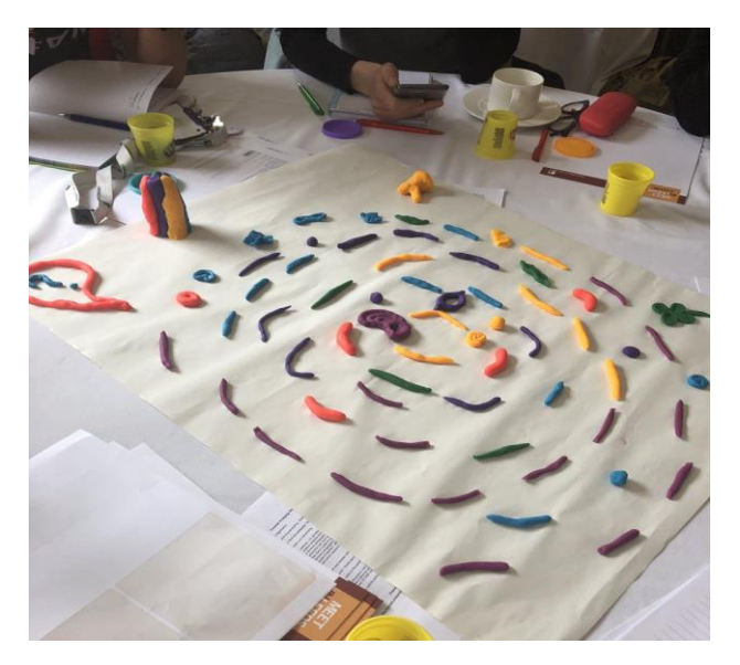
Model 4. Feminist pedagogy is about dismantling and re-building what we know