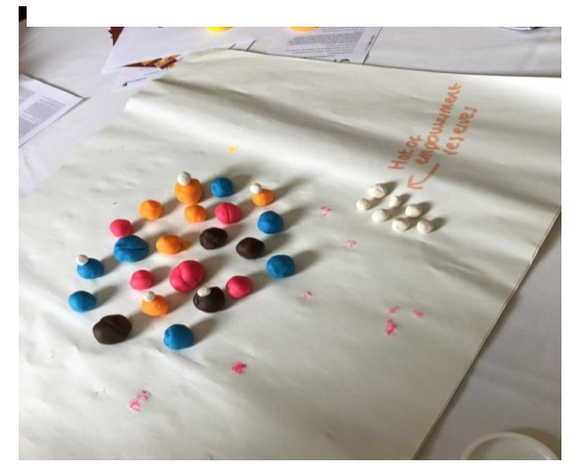
Student Engagement in Higher Education Journal Vol 3, Issue 1, May 2020