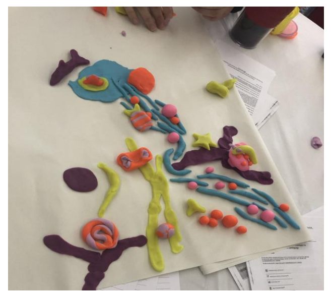
Model 3. The shapes are designed to be equal but are naturally different sizes, representing power, agency and voice

Model 2. Multifaceted voices occupying different spaces & places